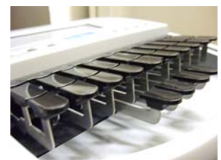
Practice steno writing 4 to 5 hours a day for constant effectiveness and knowledge retention

/W-/SU/TPEUGS/-PBT/TPH-/K-RPBLG/- PLT/-RBGS/PRAUP/-R/STRUBGZ/-RBGS/ SKW-/TKED/KAEUT/-D/EF/-RT/-RBGS/T- /S-/RAOEZ/TPH-BL/TAO/SP-BGT/A/ SAOUT/AEBL/KAEUP/-BL/STAOUPBT/ OF/STEPB/OE/TAO/U/KHAOEFB/RAOEL/ P-P/TAOEUPL/SPAOEDZ/W-/A/HAOEU/ TK-/TKPWRAOE/OF/ABG/RAES/EUPB/ TWO*/KWRAOERZ/-FPLT