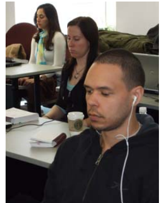
Students quickly develop their skills in Phoenix Theory and Speedbuilding

With new students arriving all the time, CCVS promises to produce a very enthusiastic new generation of Court Reporters and Broadcast Captioners for Canada.